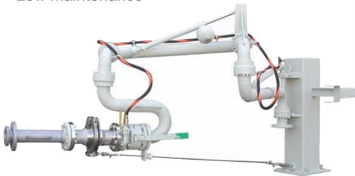
▶ Type FAS-G7